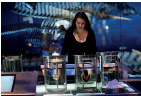
Image credit: Installation view Colossal Squid: Freaky Features!. Courtesy of Te Papa Tongarewa, National Museum of New Zealand.

Developed and toured by Te Papa Tongarewa, National Museum of New Zealand.